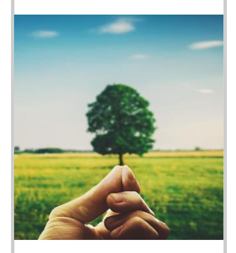
The Kingdom of God is like a mustard seed...' (Mark 4, 31-32)